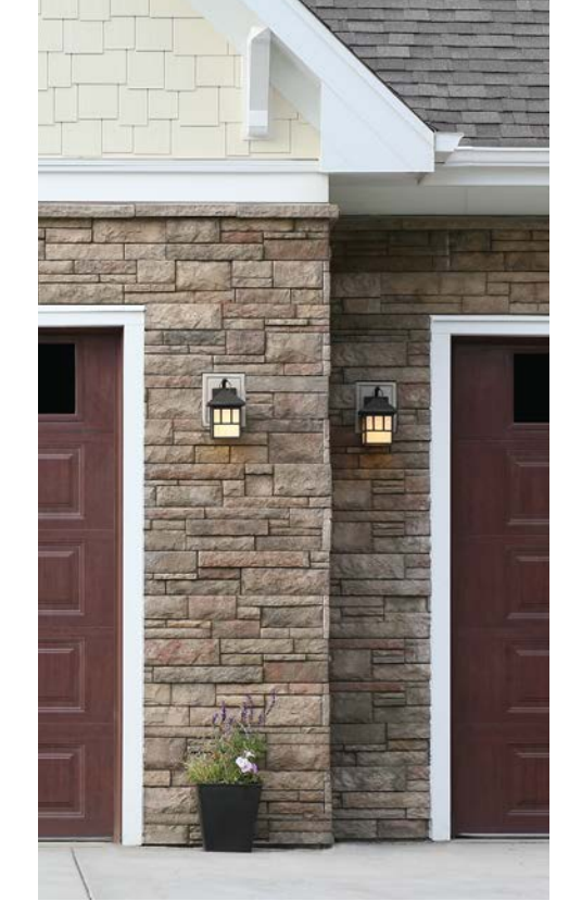
Versetta Stone Tight Cut Style in Terra Rosa