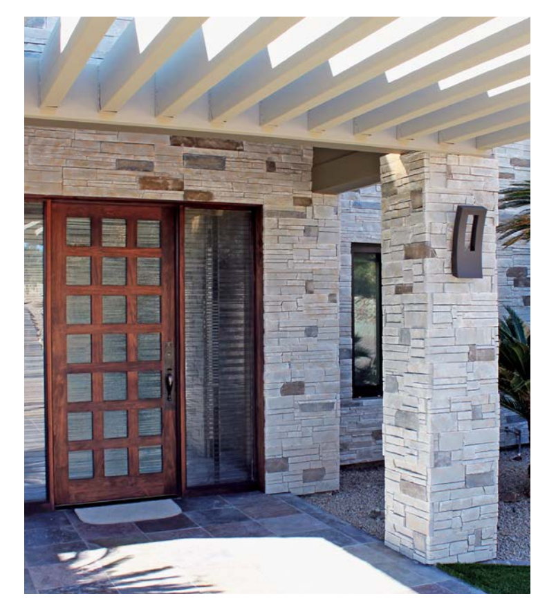
Versetta Stone Ledgestone Style in Mission Point

Versetta Stone Siding is the first brand to offer the beauty of stone in an easy-to-install product. Building off a rich heritage in manufactured stone, Versetta Stone Siding accurately replicates the textures and random colors of natural stone to complement interior and exterior applications. Any builder can now quickly install mortarless stone siding to elevate the quality and curb appeal of their homes.