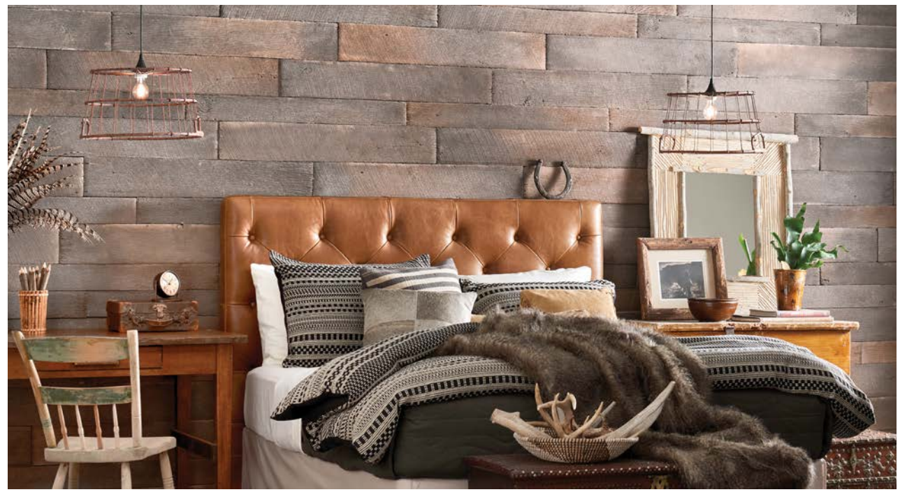
Dutch Quality Stone Weathered Plank 4 & 6 in Winesburg

Otherwise, it just wouldn't be Dutch Quality Stone.