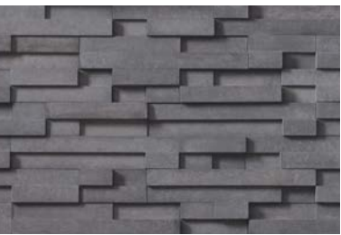
Pro-Fit<sup>®</sup> Modera Ledgestone