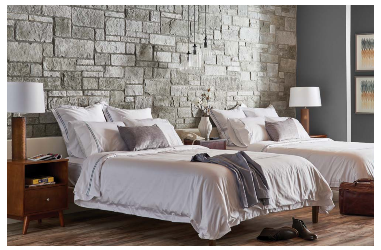
Cultured Stone Sculpted Ashlar in Silver Shore®

As pioneers of the manufactured stone veneer category, the master craftsmen of Cultured Stone have embraced excellence and artistry for more than half a century. Our premium products have inspired architects, contractors and designers across the country to design some of today's most innovative structures. As one of the most tested stone products in the industry, we strive to offer the highest quality materials through stringent control measures and rigorous standards for durability, reliability and consistency.