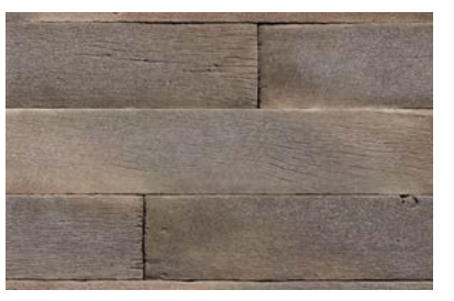
Weathered Plank 4