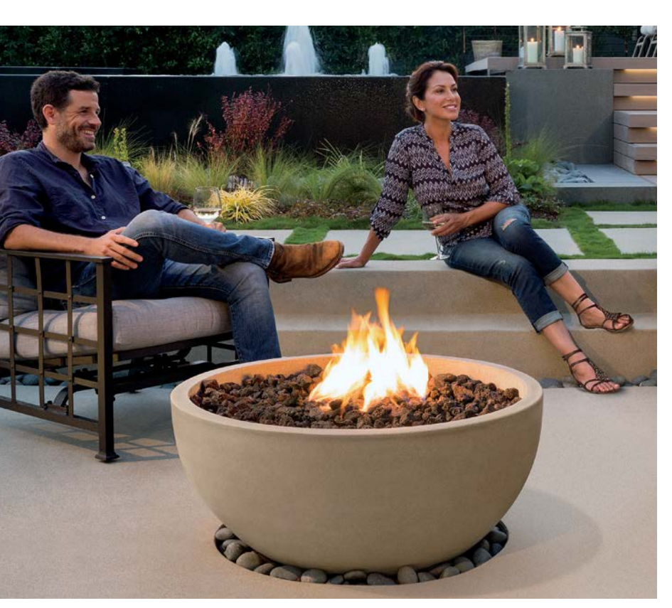
Infinite<sup>™</sup> Fire Bowl in Oyster Shell with a Honed Finish

Distinguished by craftsmanship, accentuated by firelight and designed to gather round, Kindred Outdoors & Surrounds creates memorable spaces that bring people together through thoughtful composition and functionality. With hand-forged fire bowls, fireplace surrounds and outdoor kitchens, friends and family can commune, converse, and unwind in comfort both inside and outside of the home.