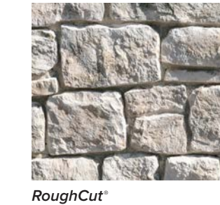
Mountain Ledge Panels