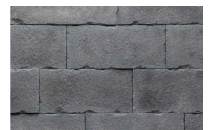
Carved Block Style